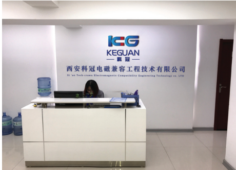
The reception area of Xi'An Tech Crown